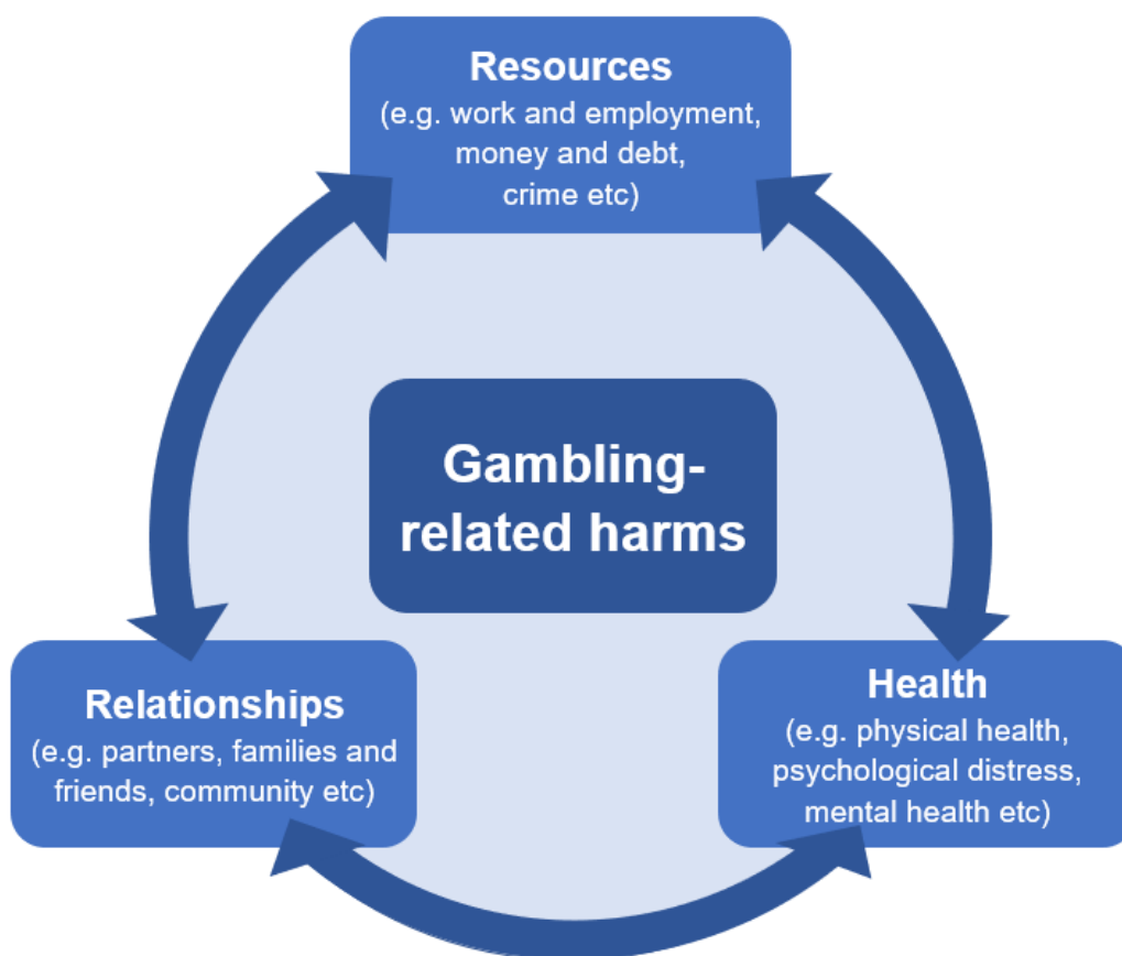
Figure 1: Overview of gambling-related harms

Finally, we acknowledge that some harms may be different for children and young people and that the proposed definitions presented here should be adapted and reviewed with children and young people in mind. This work is being currently being conducted, with likely outputs to be published in late 2018 / early 2019.